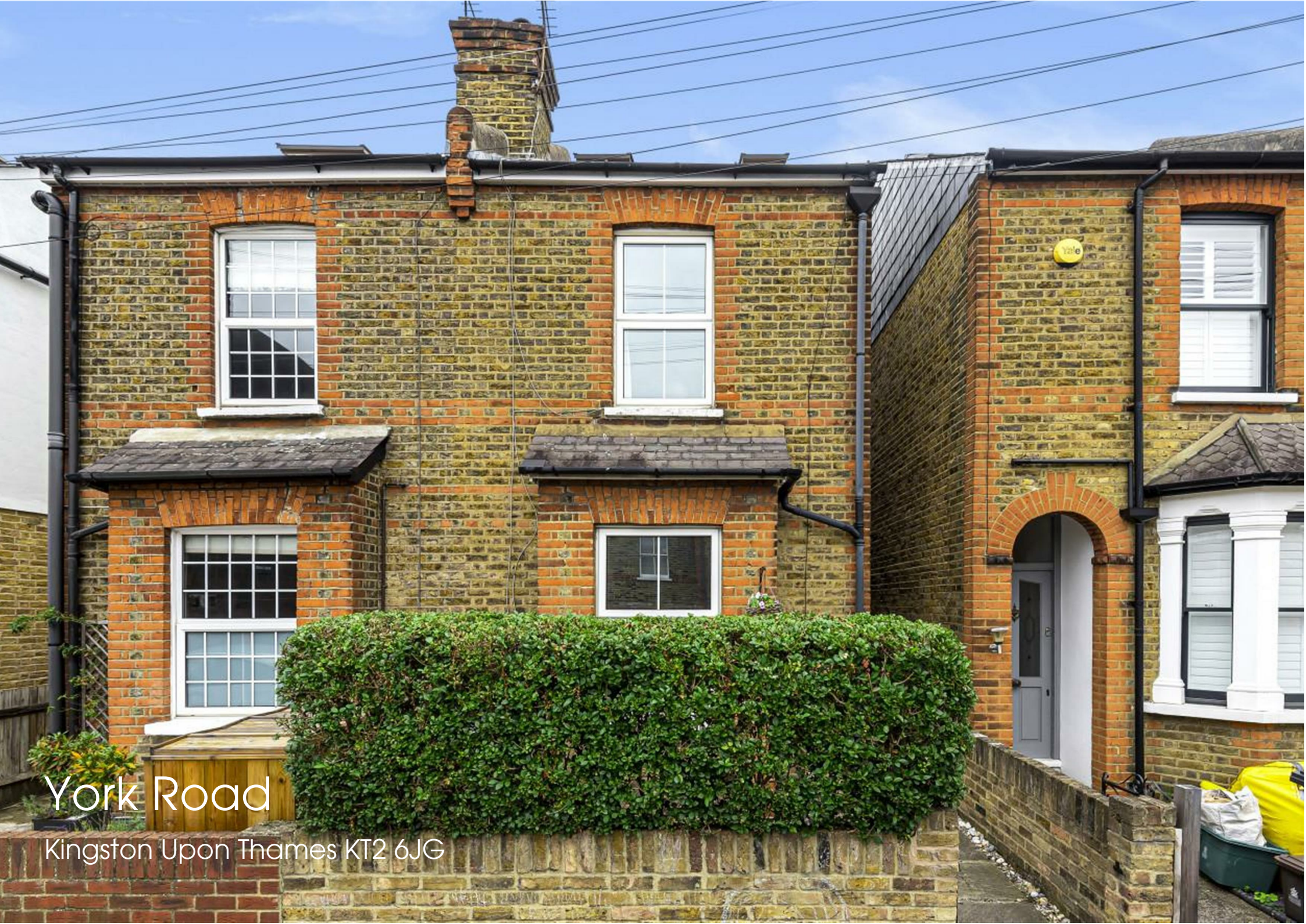
York Road Kingston Upon Thames KT2 6JG